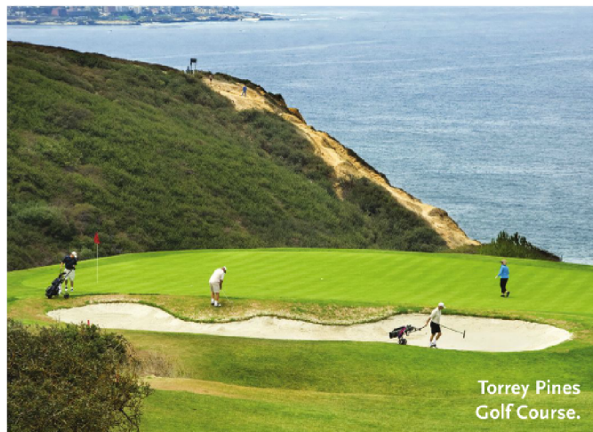
Torrey Pines Golf Course.

San Diego is renowned for having neighborhoods with their own distinctive sights, sounds and flavors. Little Italy blends urban energy with quintessential SoCal views. The main thoroughfares of India Street and Kettner Boulevard are lined with some of the city's hottest dining spots, including Juniper & Ivy and Bracero, as well as hip boutiques and the popular Saturday farmers market. • Old Town is where San Diego began, as a small settlement, in 1769. Today, visitors explore the preserved historic buildings, as well as restaurants and shops. • City history and modern cultural offerings are well represented in the Gaslamp Quarter , with its shops, galleries, museums and nightlife hot spots. • Craft brews rule in the hipster, pedestrian-friendly enclave of North Park , home to numerous bars, pubs and breweries. • Explore emerging art in Barrio Logan , anchored by the impressive outdoor murals at Chicano Park. Then pay a visit to La Bodega Gallery for art shows and the Chicano Art Gallery for gifts and decor by local artists.