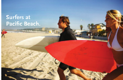
Surfers at Pacific Beach.